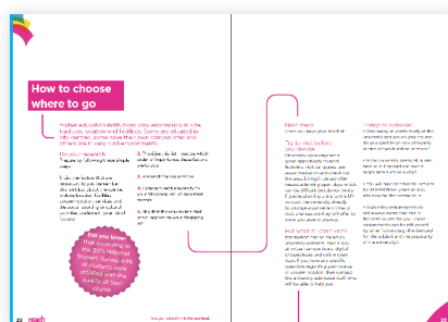
ADVICE ON WHERE TO GO