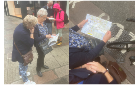
Advertisements on other maps are folded away

Research has shown that people using the town side of other visitor maps in its present format tend to fold away the advertising (Right). With a map sat sideways, it is folded as a smaller item to hold. Our newly designed map is now landscape, with ads down each side to view at all times when looking at St Helier, with other map panels prominent in their own right.